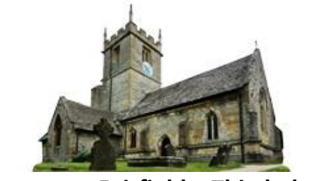
Hampton – Fairfield – Thistledown Eastwick Park – Charity Crescent